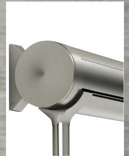
Round box with integrated weight bar